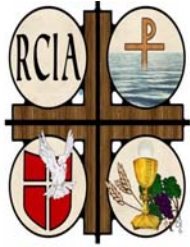
Rite of Christian Initiation for Adults

Are You Interested in Becoming a Catholic? Do You Know Someone Who May Be Interested? In RCIA, we journey with this question and all of your questions about Catholicism and what it means to follow Jesus as a Catholic. We share how God created us to love us and what that means for our lives. How do we respond to this great love? The first phase of RCIA is inquiry and the time to start inquiry is when you are interested or have questions. You can come to inquiry without any commitment on your part. You can simply come to learn more about God's love for you. Those who want to deepen their faith are also welcome.