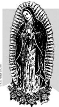
Our Lady of Guadalupe

More information is available at St. Luke Catholic Church Religious Education Office Tel # 650-574-9191 email address: st.lukereed@gmail.com